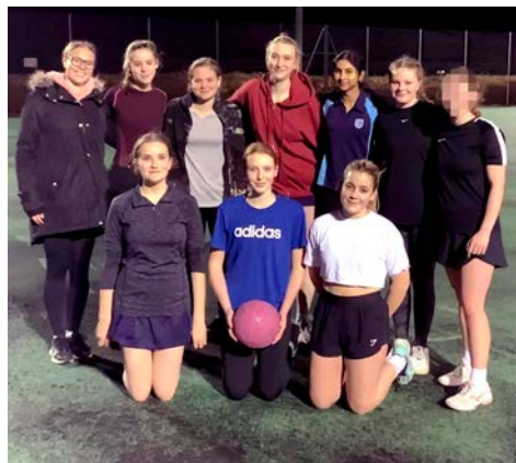
Sixth Form Netball team.

We are so proud of the students' resilience and positivity, and the way they have represented the school has been fantastic. It is so positive to see our young people expressing themselves, showing unity as a team and enjoying and embracing the exertion and