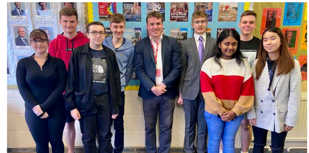
Earlier in the term, Tom Hunt came to Northgate Sixth Form to speak to our Year 13 Politics students, discussing his role as Ipswich's MP since he was elected in the 2019 general election.