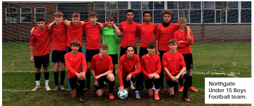
Northgate Under 15 Boys Football team.

physical and emotional challenges that sporting competition can bring.