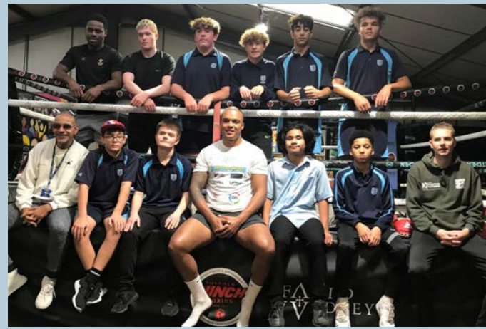
The group of students pictured were very lucky to be given the opportunity to visit Suffolk Punch boxing club recently, to train with a professional coach. They were also fortunate to have Catch22 join the trip. The aim is to help with behaviour management, to give students a positive energy outlet and form good rapports with coaches.