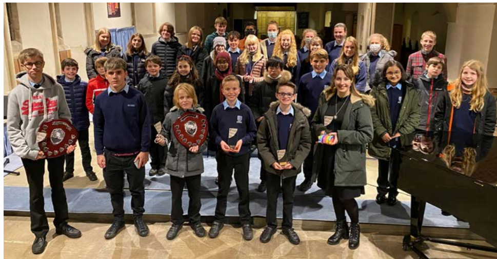
Northgate Young Musician of the Year performers at Rushmere St Andrew Church.